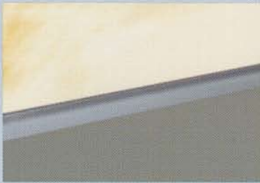
Finished Water Trek Aqua Route® with Cove Base

“Where design innovation keys our superior products™”