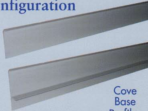
Cove Base Profiles

Basement Technologies' Cove Base is an integral part of the Water Trek Aqua Route ® two-piece system. The various Cove Base designs hug walls and channels water from the wall above to the sub-floor Water Trek Aqua Route ® system below.