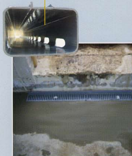
Floor grate at bulkhead door.

Addresses water in front and in back of footing.