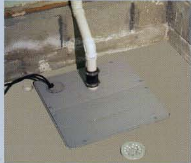
The Water Grabber® Bull Dog™, the patent pending sump that does not look like a sump.