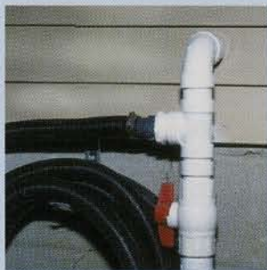
The Patented Alternator™

Please ask your Basement Technologies representative for more details on the various Cove Base designs available and for other great waterproofing products.