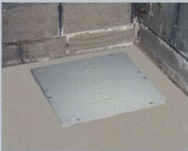
The Water Grabber® Bull Dog™ with a sealed lid allows carpet or flooring to lay directly over the pump unit.