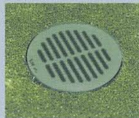
The Bubbler Pot™